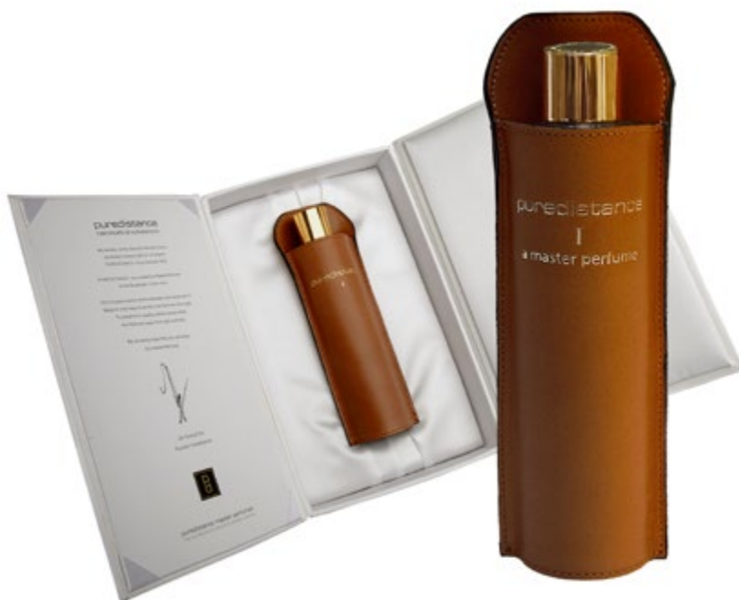
Puredistance I Perfume - 100 ml