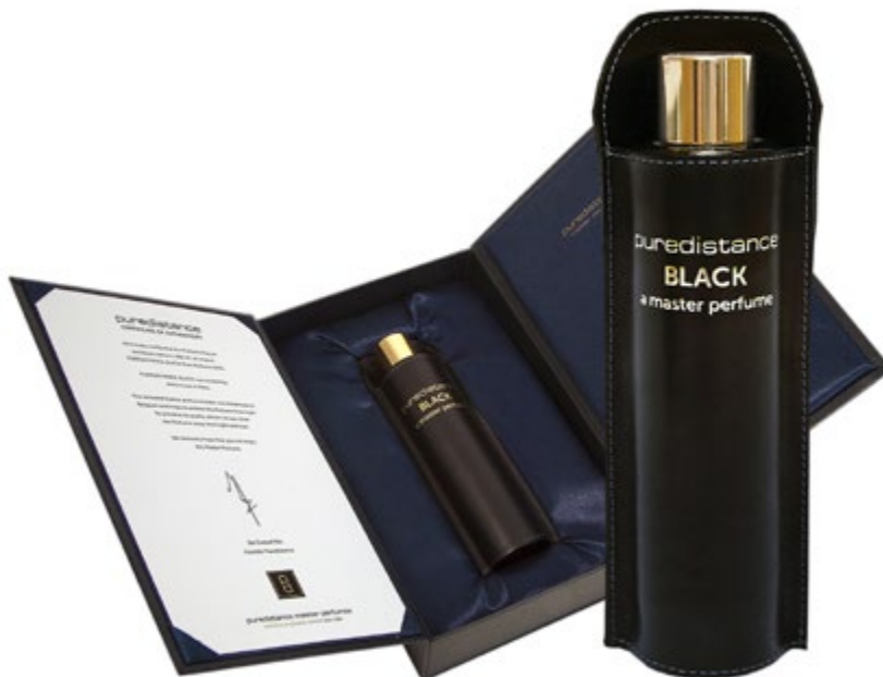
Puredistance BLACK Perfume - 100 ml