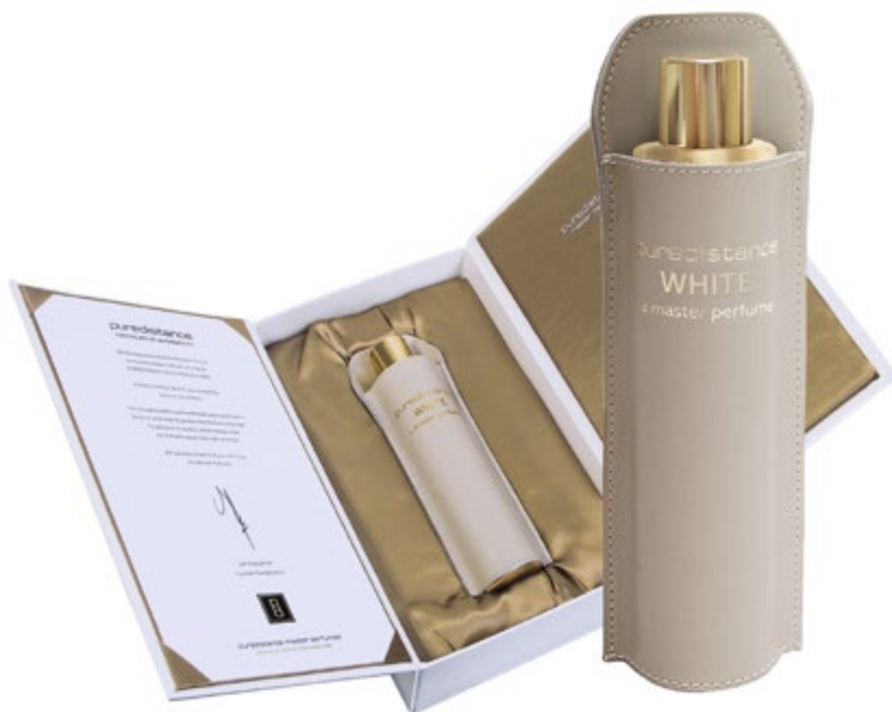
Puredistance WHITE Perfume - 100 ml