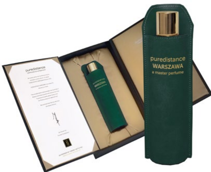
Puredistance WARSZAWA Perfume - 100 ml