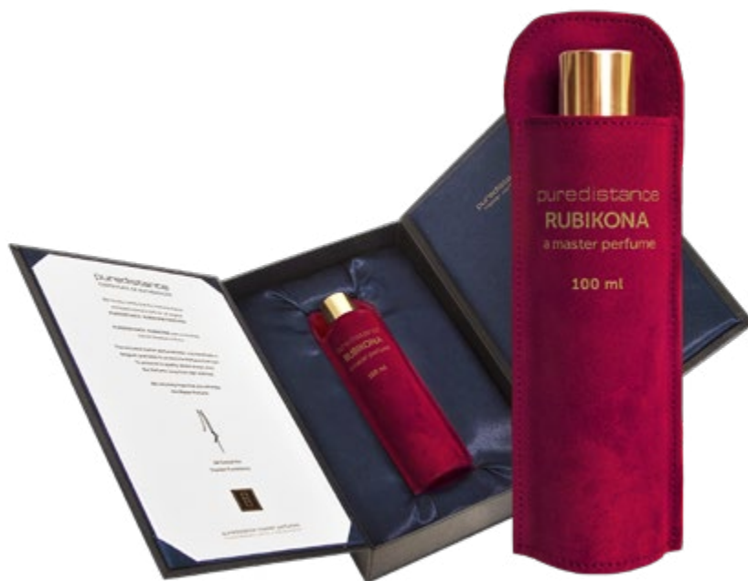
Puredistance RUBIKONA Perfume - 100 ml