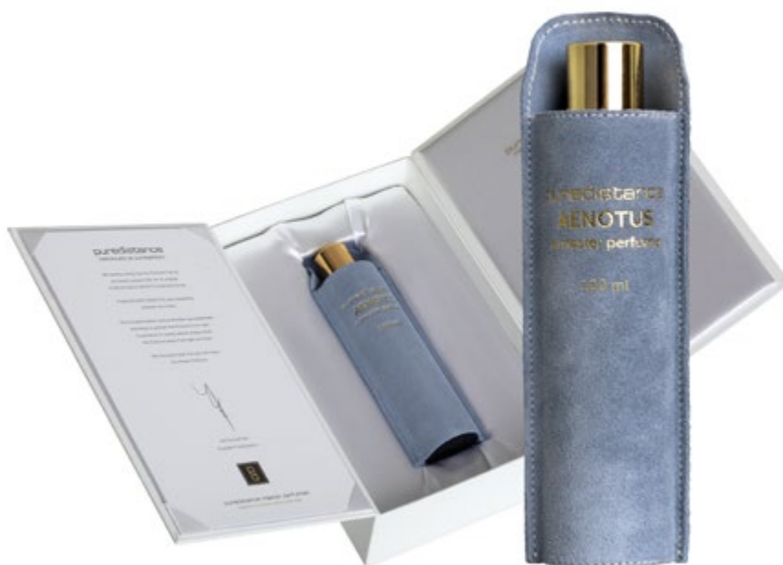
Puredistance AENOTUS Perfume - 100 ml