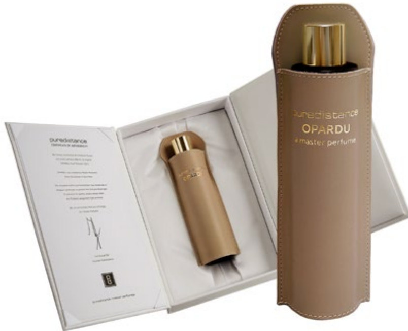
Puredistance OPARDU Perfume - 100 ml