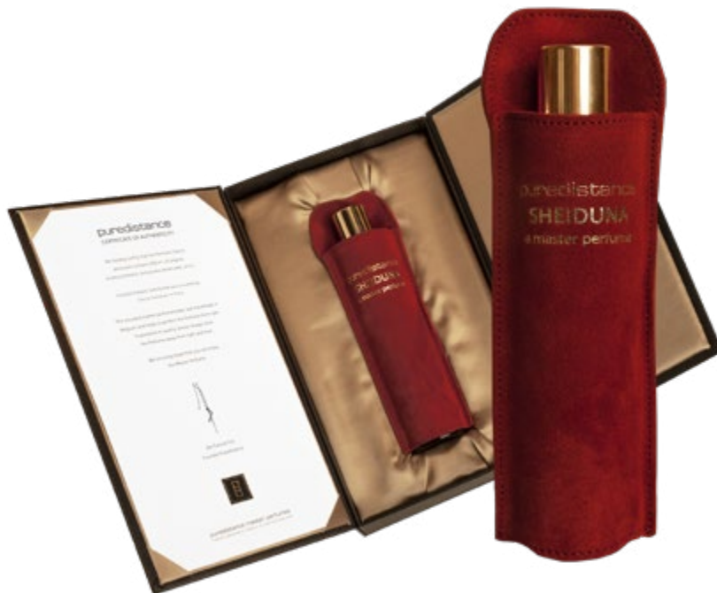
Puredistance SHEIDUNA Perfume - 100 ml