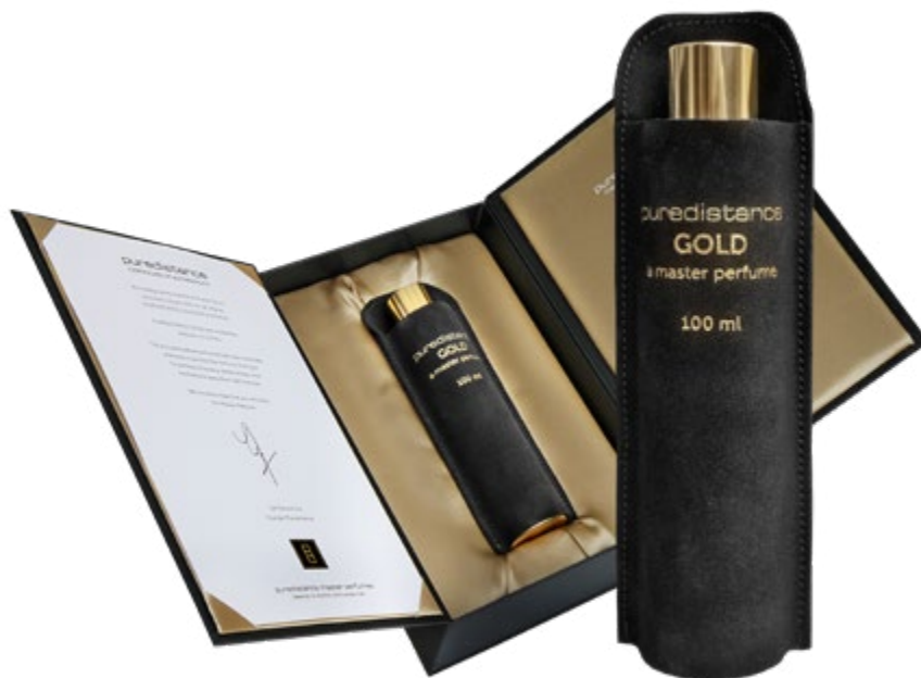
Puredistance GOLD Perfume - 100 ml