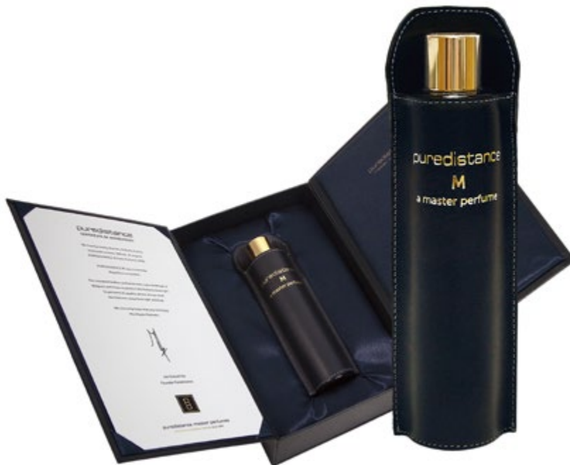
Puredistance M Perfume - 100 ml