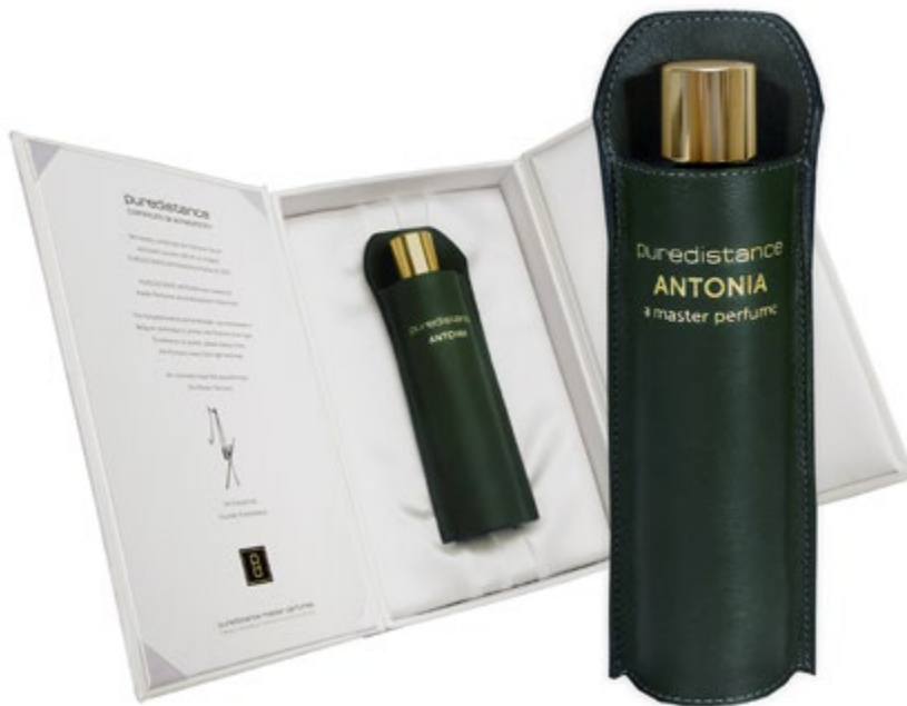
Puredistance ANTONIA Perfume - 100 ml