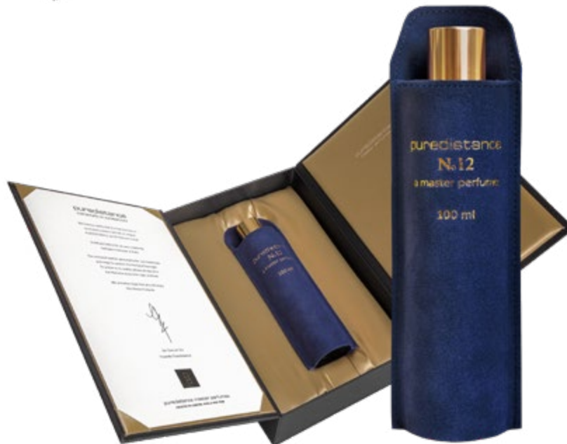
Puredistance No.12 Perfume - 100 ml